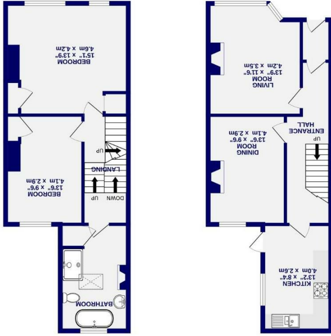
GROUND FLOOR 94 sq ft. (8.7 sq m.) approx.

Whilst every attempt has been made to ensure the accuracy of the floorplan, measurements of rooms and any other areas are approximate. It is advised that you should verify the measurements and floor plan of the overall floor area and no responsibility is taken for any error, omission or mis-statement. This plan is for illustrative purposes only and should be used as a guide only. The vendor, Ashtons and appliances shown have not been measured and no guarantee as to their operation. Measurements are given to the nearest millimetre.